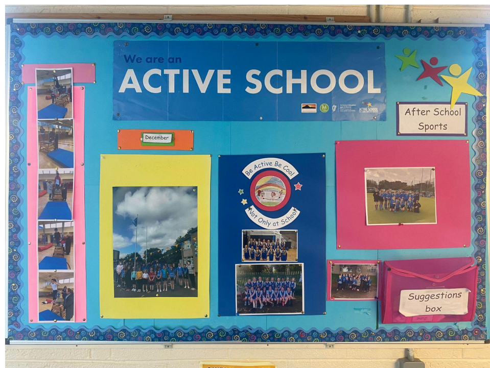
Active Schools December