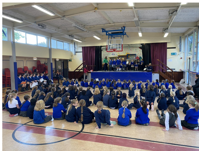
Green Schools Committee Assembly in the Hall