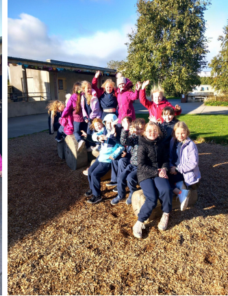
3rd/4th visit Airfield!