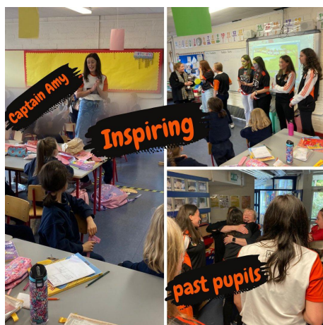
St John's Visit

We welcomed the St. John's Senior Ladies Camogie team to celebrate their amazing County Final win! It was a great day for the school and community!