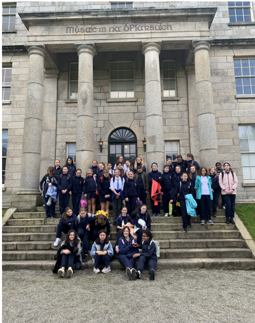
6th Class at St Enda's